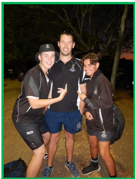
Ramsay boys at the Rugby Tens Grand Final, Saturday 14 th