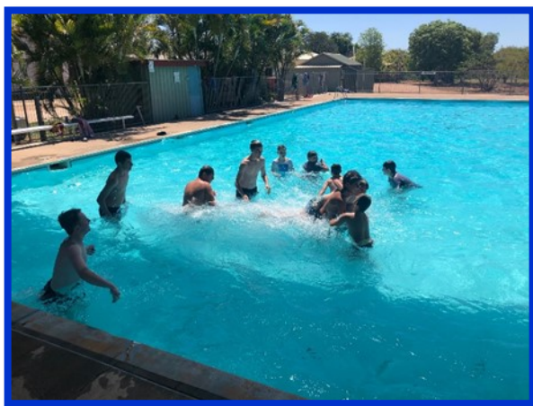
Ramsay boys playing pool footy