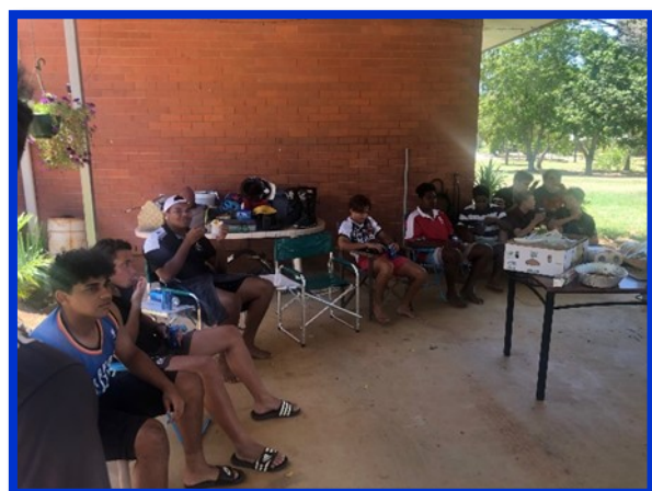
Weekend BBQ at Ramsay